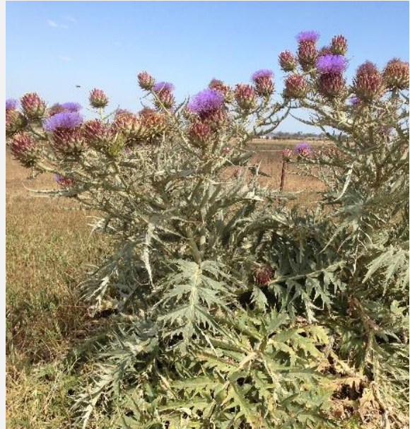
Artichoke Thistle ( Cynara cardunculus )