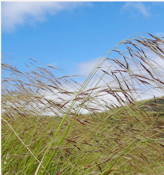
Chilean Needle-grass ( Nassella neesiana )