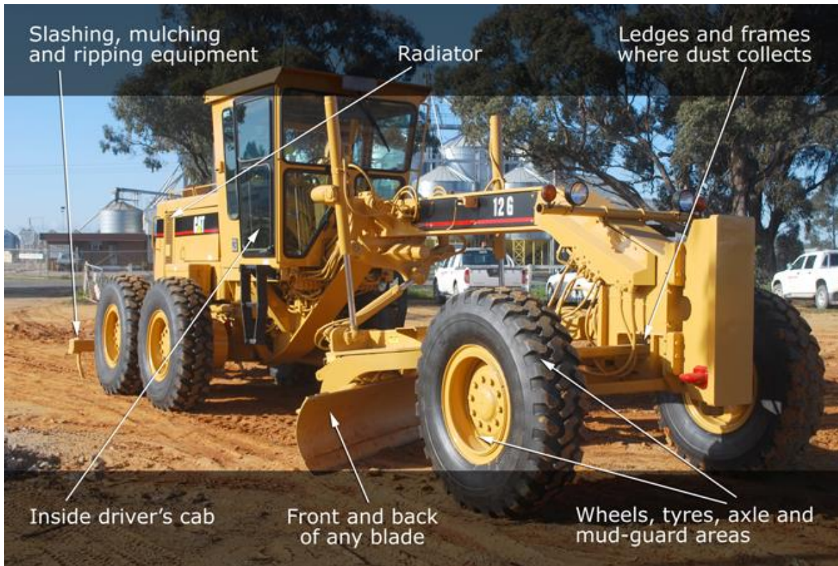
Figure 1 Critical contamination areas in earthmoving vehicles