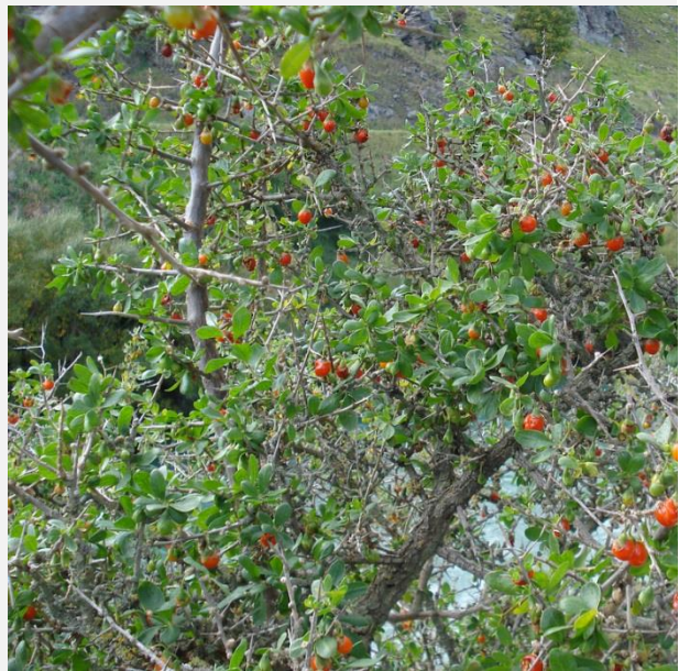
African Boxthorn ( Lycium ferocissimum )