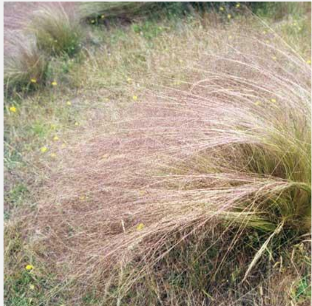
Serrated Tussock ( Nassella trichotoma )