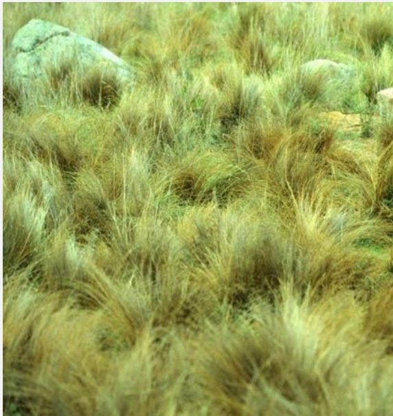
Serrated Tussock ( Nassella trichotoma )