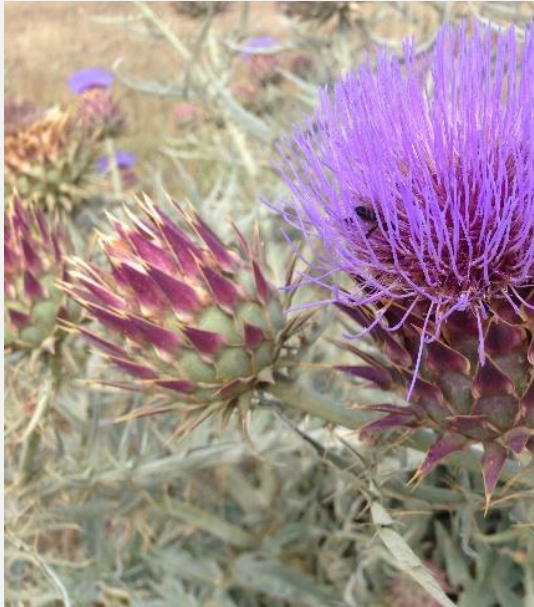
Artichoke Thistle ( Cynara cardunculus )