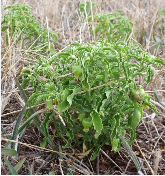
Prairie Ground-cherry ( Physalis hederifolia )