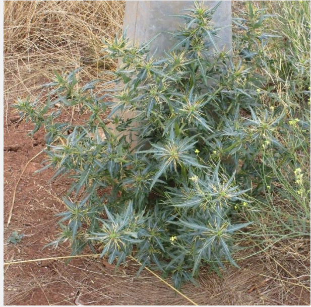
Bathurst Burr ( Xanthium spinosum )