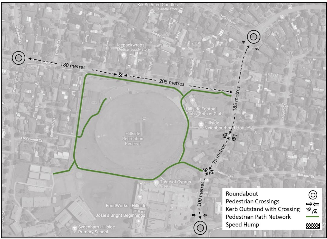
Figure 4 shows distances of less than 200 metres between LATM devices. This falls below the threshold for consideration of further traffic calming measures outlined in Council's Traffic Calming Policy.

Figure 4 Section 2 of Royal Crescent & Landscape Drive