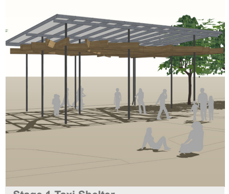
Stage 1 Taxi Shelte