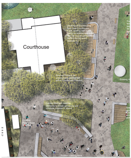
Former Melton Court House