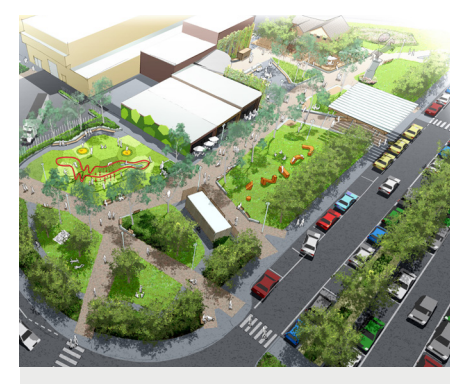
View from the corner of Palmerston and McKenzie Street towards High Street.