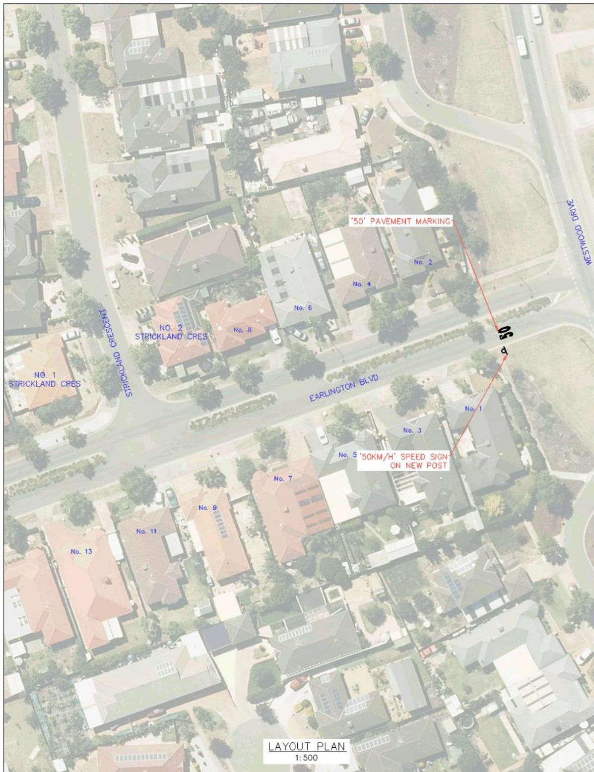
EARLINGTON BOULEVARD, BURNSIDE OPTION 2 – SIGNAGE AND LINE MARKING